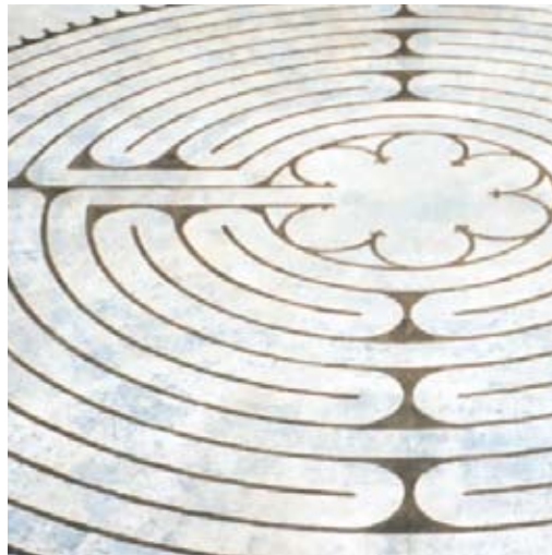
OUR LADY OF FATIMA RETREAT HOUSE INDIANAPOLIS, INDIANA

WITH ONE ENTRANCE AND A CENTER, A LABYRINTH WALK MIRRORS A LIFE JOURNEY. WALKED ALONE OR WITH OTHERS, THE JOURNEY OF CONTEMPLATION AND MEDITATION TOWARDS THE CENTER FOSTERS ENLIGHTENMENT—WITH NO TWO JOURNEYS THE SAME. THE SPIRITUAL GROUNDS' LABYRINTH SERVES AS YET ANOTHER PATH TO SELF-DISCOVERY AND A REMEMBRANCE OF OUR HUMANITY.